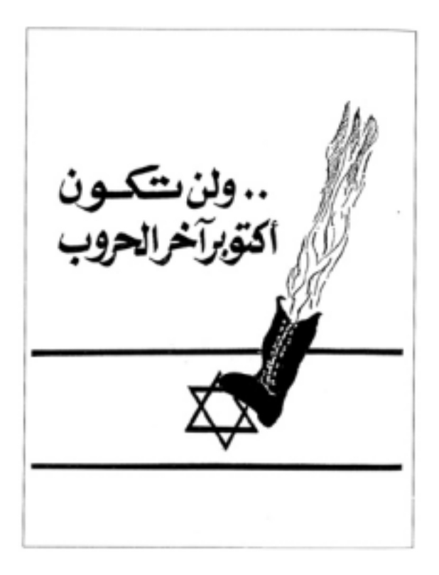
Egypt, October , organ of the Egyptian army, 1993. Cover page of the issue: "The October War Was Not the Last..." 15 years after Camp David (sic).