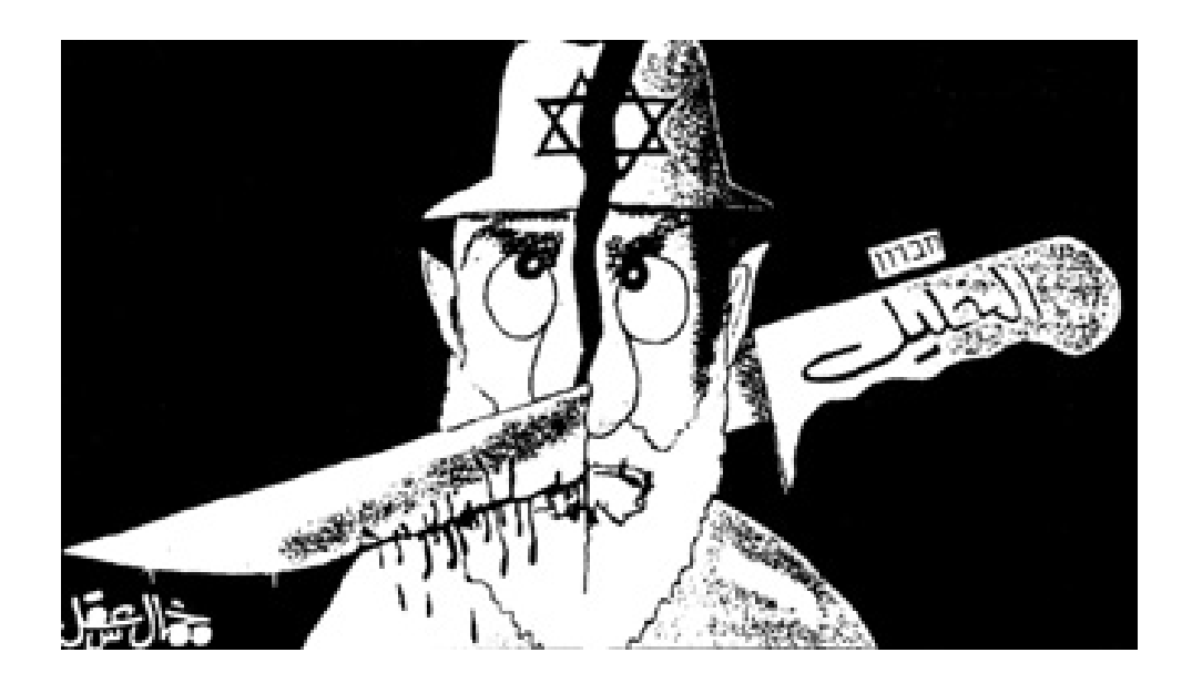
Jordan, a-Dastur , an Amman daily, 1996. After the evacuation of Hebron. Two years after the peace agreement.

Along with the open preparations for war, the Arab world, led by Egypt, Syria, Jordan, and the Palestinian Authority, is conducting a campaign of venomous anti-Semitism in the education system and the media. This, in keeping with the Nazi precedent, is intended to prevent Israel's political legitimization and to dehumanize the Jewish individual.