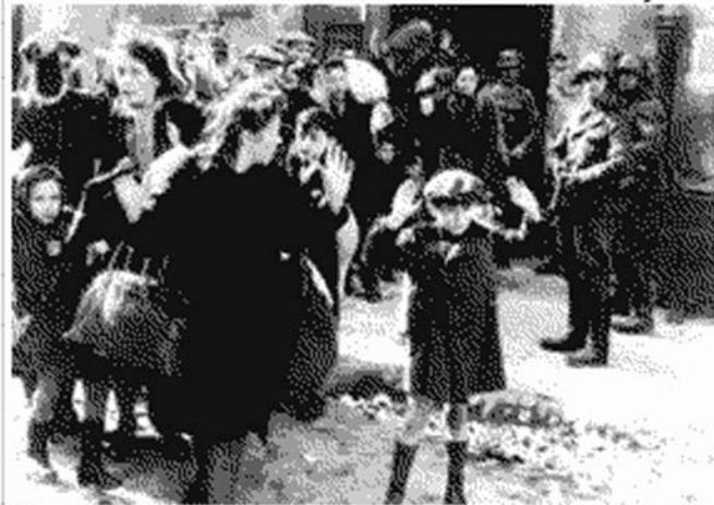
SS peacekeepers protect German civilians from Jewish attacks

JEWISH RESISTANCE SHATTERS HOPES FOR A PEACEFUL FINAL SOLUTION How could both sides have blundered so badly?