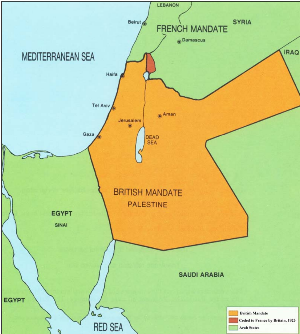
Map 1: The Jewish National Home (British Mandate), 1919